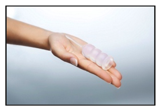
Fig. 1 IncoStress device

IncoStress, the time of usage and reasons to stop using the device as well as acceptability of using it during activities such as exercise, gardening, social events, shopping and housework.