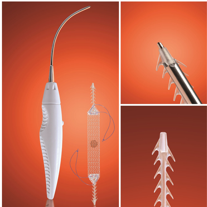
Fig. 1 a–c Surgical set. Detail of Ophira Mini Sling System antirotational tip and retractable insertion guide