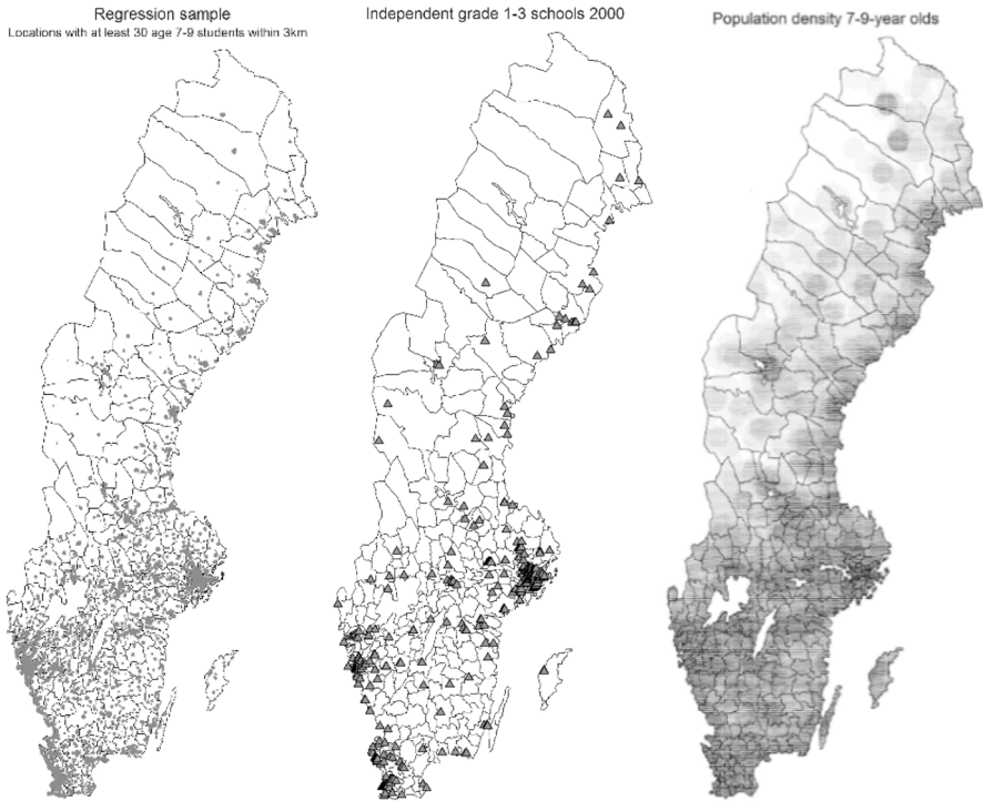
Fig. 3 Maps over the regression sample grid cells for the 1\text{ km} \times 1\text{ km} grid, the location of independent schools offering grades 1–3 in 2000, and the population density of 7–9-year olds in 1991

coordinate points to a larger grid, consisting of 1\text{ km} \times 1\text{ km} squares. 32 The choice of exactly 1\text{ km} \times 1\text{ km} sized grid cells is arbitrary, and as an alternative, I also provide results from using a smaller 0.5\text{ km} \times 0.5\text{ km} sized grid, thus changing the scale of the spatial units in the terminology of the MAUP.