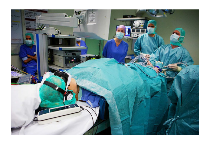
Fig. 1 Patient undergoing surgery wearing the 'HappyMed®' AVD system in the operating room. Photo taken with consent of all involved

the intervention was not interrupted. Any interruptions were documented. The intervention was initiated after time-out procedure and immediately before surgery started. Systems were activated before the first incision and deactivated after dressings were applied to the wounds, just before sign-out.