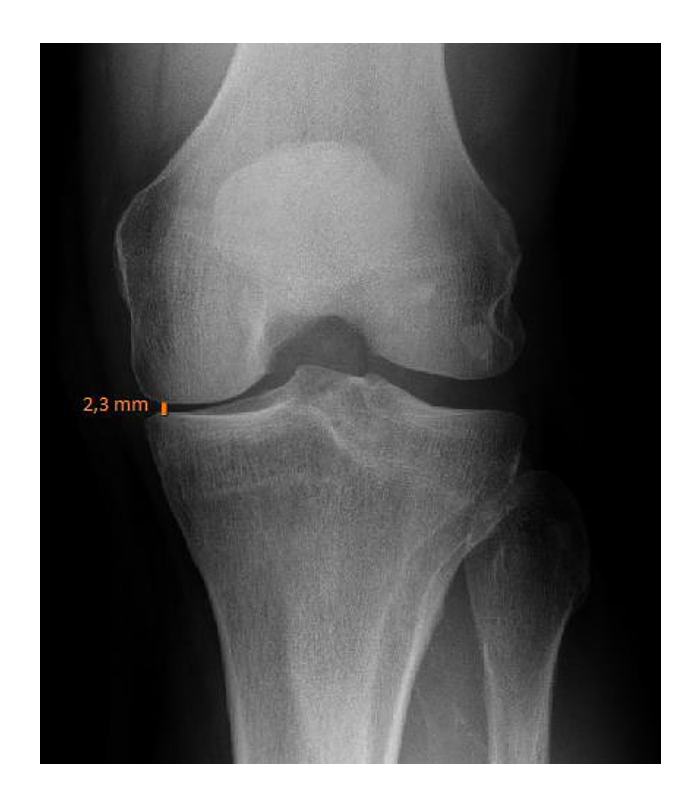
Fig. 1 Measurement of joint space width from weight-bearing Schuss-view radiographs

Data analysis was performed with R version 3.6.3. (The R foundation for Statistical Computing, c/o Department of Statistics and Mathematics, University of Vienna, Vienna, Austria). The Mann–Whitney U test was applied to test for significant differences between groups regarding the WOMAC