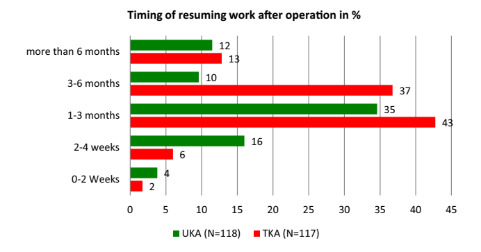
Fig.2 Time when patients resumed work after uni and total knee arthroplasty in %

the patients worked fewer, 73 (62%) worked the same, and 3 (3%) worked more hours after UKA.