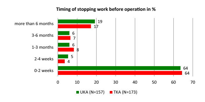
Fig.1 Time when patients stopped work before uni and total knee arthroplasty in %

Of the 117 UKA patients who returned to work, 18 (15%) had a less, 58 (50%) an equally, and 17 (15%) a more physically demanding job after UKA. In addition, 15 (13%) of