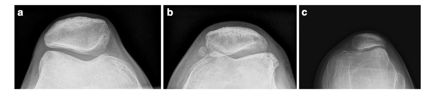
Fig. 2 Conventional radiographs of the three grades of patellofemoral OA according to the Iwano classification showing a grade 0, no features of OA; b grade I, remodelling; c grade II, joint space narrowing of <3 mm