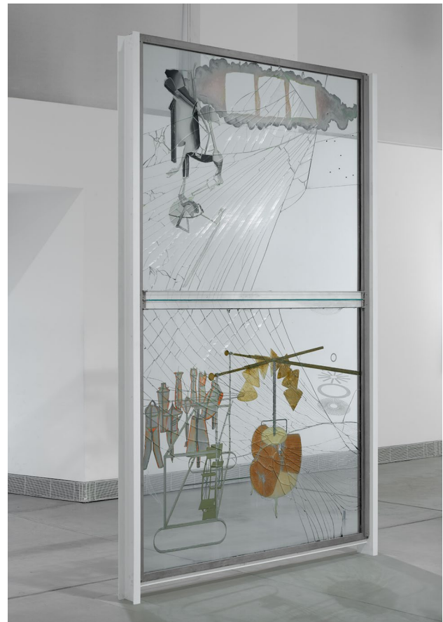
Fig. 1 Marcel Duchamp, The Bride Stripped Bare By Her Bachelors, Even (The Large Glass) , 1915–1923. Philadelphia Museum of Art, Bequest of Katherine S. Dreier, 1952, 1952–98-1 © Artists Rights Society (ARS), New York / © Association Marcel Duchamp / ADAGP, Paris and DACS, London 2021. Courtesy of Philadelphia Museum of Art, ADAGP and DACS

Related to the halting problem—the question of whether or not a programme will halt after a thousand, million or billion years—Omega is ‘the concentrated distillation of all conceivable halting problems’ (Calude quoted in Chown 2007, 328). As such, it is ‘a cabalistic number’ which ‘can be known of, but not known through human reason (Bennett quoted in Chown 2007, emphasis mine). As a sequentially ordered computational processing of zeros and ones, Omega shows that there is an internal, intrinsic dynamic at work in every computation process negating the teleological, logic- and sequence-locked view of computation where randomness is seen as an error in the computation’s formal logic. This further means that, like Duchamp’s Three Standard Stoppages , incomputability is an ontological possibility—a possibility of an indeterminate coming-into-being—within and inseparable from computation. In Three Standard Stoppages , we see this in a schematic, step-by-step (or metre-by-metre) way; the example is useful precisely because it’s