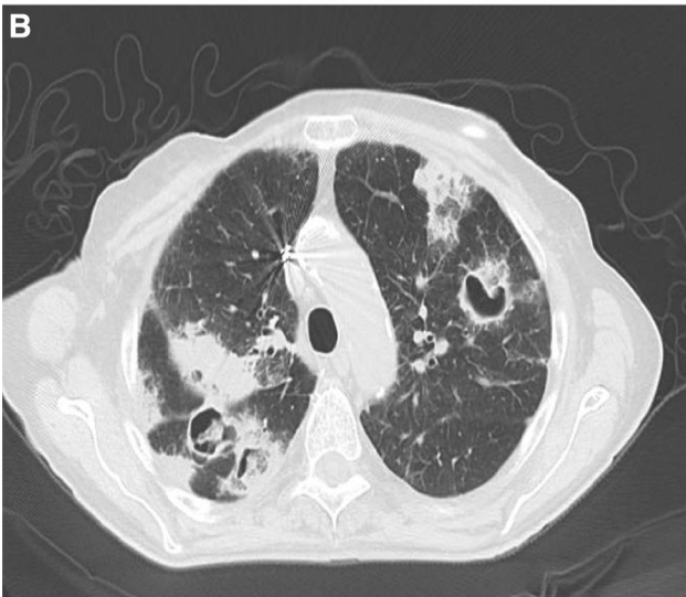
Fig. 2 a, b CT scan of the chest of a 68-year-old woman with history of breast cancer on chemotherapy, diagnosed with Gramnegative ventilator-associated pneumonia (bronchoscopy with biopsy and BAL—positive for Klebsiella in culture and in the tissues, along with E. coli ). She was initially treated with tigecycline in view of beta-lactam allergy but had clinical and radiographic deterioration (b). Antibiotics were changed to intravenous aztreonam and inhaled tobramycin with clinical and radiographic improvement

lung infections) noted that the success rate was higher with longer duration of treatment (more than 9 days). They used tigecycline as part of a combination regimen in 67 % of patients, but with no impact of combination therapy on mortality [72].