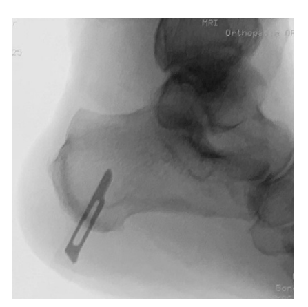
Fig. 2 ▲ Lateral view of the fluoroscopic control of the determination of the incision

bundle medially or cutaneous nerves laterally, suggesting this procedure is safe. One might suppose that a medial incision places the medial structures at risk of damage due to its anatomical proximity. We believe the contrary occurs. After medially incising the skin, the soft tissue containing nerves can easily be protected with the nick-and-spread technique. Once the burr is inserted into the bone (safe hole technique), the medial structures