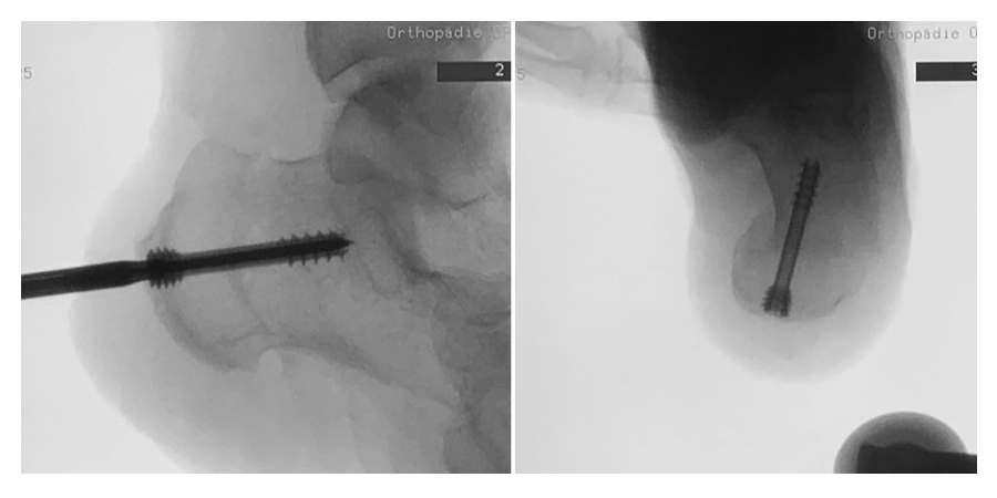
Fig. 4 ▲ Final fluoroscopic lateral (left) and axial (right) images after insertion of one headless compression screw (6.5 mm)

not at direct risk; therefore, this approach is safe. Nevertheless, the neurovascular bundle can be at risk even if a lateral approach is used and the cut is too distal ( • Fig. 5). In this context, a safe zone of the skin incision and osteotomy cut have been defined [21]. To our knowledge, no medial incision for a MICO has been described. In our patients treated with MMICO, we could not observe any permanent damage to the neurovascular