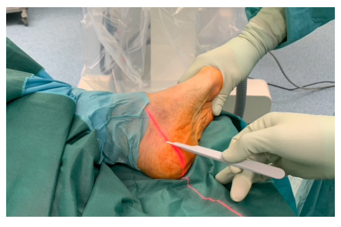
Fig. 1 < Determination of the osteotomy site with help of fluoroscopy with the leg in external rotation