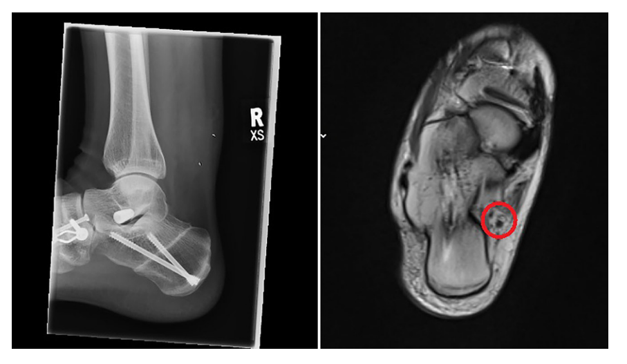
Fig. 5 ▲ X-ray lateral ( left ) and MRI axial images ( right ) after flatfoot reconstruction. Even though the calcaneal osteotomy does not seem to be excessively too distal, the neurovascular bundle medially is at risk ( red circle )

with lateral sliding calcaneal osteotomies is thought to be higher [4, 13, 14, 16]. Additionally, we performed a lateral sliding of the tuber not exceeding 15 mm. Furthermore, we agree with other authors that if the medial approach is used the periosteum of the medial calcaneus is routinely elevated or perforated with the