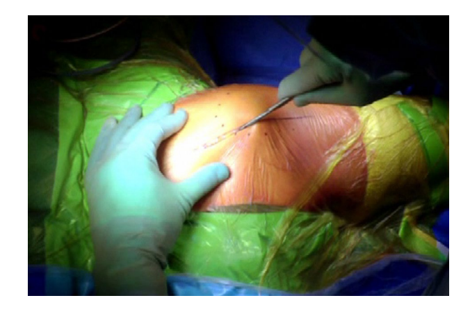
Fig. 1 A skin incision is made between the level of gluteus maximus insertion on the femur, along the posterior border of the greater trochanter, curving gently posteriorly in the region proximal to the tip of the greater trochanter

The patient is positioned in the lateral position with both hips in slight flexion and neutral rotation. A skin incision is made from the area where the tendon of gluteus maximus inserts on the femur, along the posterior border of the greater trochanter to reach the area proximal to its tip (Fig. 1). Dissection is made down to the fascia lata, which is incised