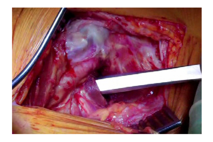
Fig. 3 A plane is developed by passing a periosteal elevator between the capsule and the proximal short external rotators (namely gemellus inferior, obturator internus, capsule gemellus superior and piriformis)