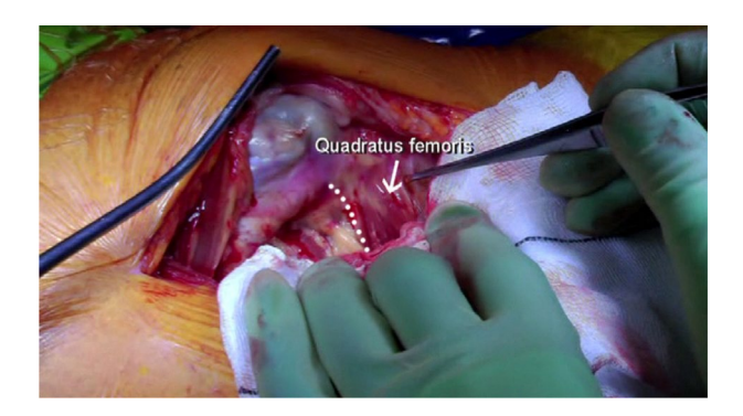
Fig. 2 The interval between the insertions of quadratus femoris and gemellus inferior muscles onto the posterior aspect of the greater trochanter is identified by blunt dissection