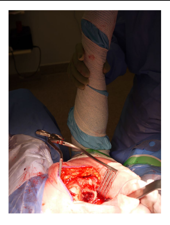
Fig. 7 Osteotomised femoral neck ready for access and preparation of the proximal femoral canal. Note the insertions of the proximal short external rotators on the medial surface of the greater trochanter, positioned anterior to the entry point for instrumentation of the femoral canal

Prior to closure, two 2.5 mm drill holes are made on the posterior aspect of the greater trochanter at the level of each stay suture, which are passed through. A stay suture may be passed through the gluteal insertion on the greater trochanter. Figure 9 shows three stay sutures used, one of which passed through the gluteal tendon insertion. The stay sutures are tied accordingly with each knot positioned over its respective hole avoiding prominence. Each suture is then trimmed short once tied. Thorough irrigation with saline is