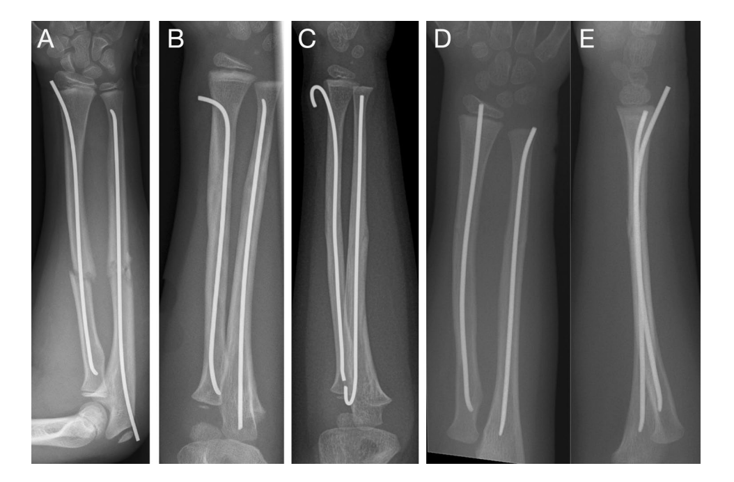
Fig. 2 Ideally cut TEN implanted at the distal lateral radius (A), and distal dorsal radius (D, E). For better retrieval during metal removal, partial bending (B) or complete bending (C) of the nail are performed