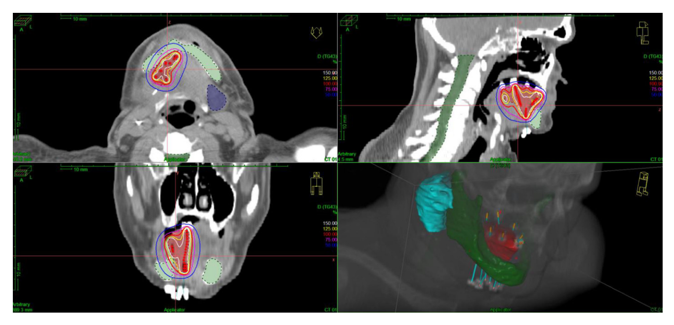
Fig. 2 Dose distribution in relation to planning target volume (PTV, red volume ) in axial, coronal and sagittal views, and three-dimensional computed tomography (3D-CT) reconstruction of the implanted catheters ( blue lines ) and patient anatomy on bottom right