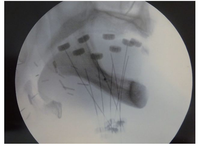
Fig. 1 Lateral X-ray of 8 implanted flexible plastic catheters with markers and fixing plastic buttons

volume. The dose was prescribed to the mean dose in the reference points. As in 2000 CT imaging was introduced in the treatment planning, the next 31 patients (69%) were treated with CT-based planning. The planning target volume (PTV), which is equal to clinical target volume (CTV) was determined using information obtained from presurgery images, surgical and histological reports and palpation of the tumour bed. The PTV included the tumour bed with a 5 mm isotropic margin. To position the needles/catheters the rules of the Paris system were followed, but the dosimetry was based on the 3D target volume (conformal dose planning method). The reference dose points were placed on the surface of the PTV, and dose optimisation on the dose