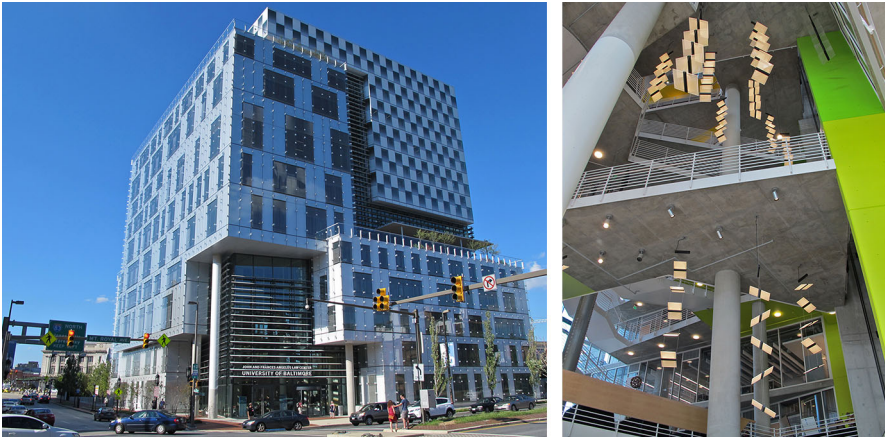
Fig. 1 Exterior (left) and interior (right) of the John and Frances Angelos Law Center.

exchanging ideas well beyond the time allotted for coffee breaks, the main hall and inner courtyard were also sites for spontaneously held math-art workshops.