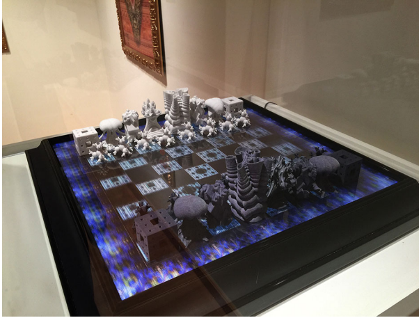
Fig. 4 3-Dimensional Fractal Chess Set with Menger Sponge based Lenticular Board by Louis Markoya