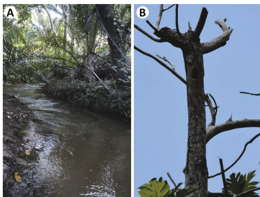
Figure 2. Tibiri River within the forest fragment in which Dryocopus lineatus was recorded (A). Tree-cavity nest of woodpecker on a dead tree (snag; B).

Visual and acoustical signals of the bird were recorded until October 2014 and ~6 tree-cavity nests (Fig. 2B) were accounted in the area. The most common sounds were territorial calling and drumming. Sighting of the woodpeckers were reported by local residents on each consecutive year (2015, 2016 and 2017) after the initial record in 2014, including a low-resolution video provided by one of them in 2016 (supplementary material). They also reported that the detections of the bird started in September and lasted until October, with often more than one individual observed at the same time. The authors validated the information provided by residents by showing photos of the bird ( i.e. species identification) and inquiring about the record ( e.g. , microhabitat,