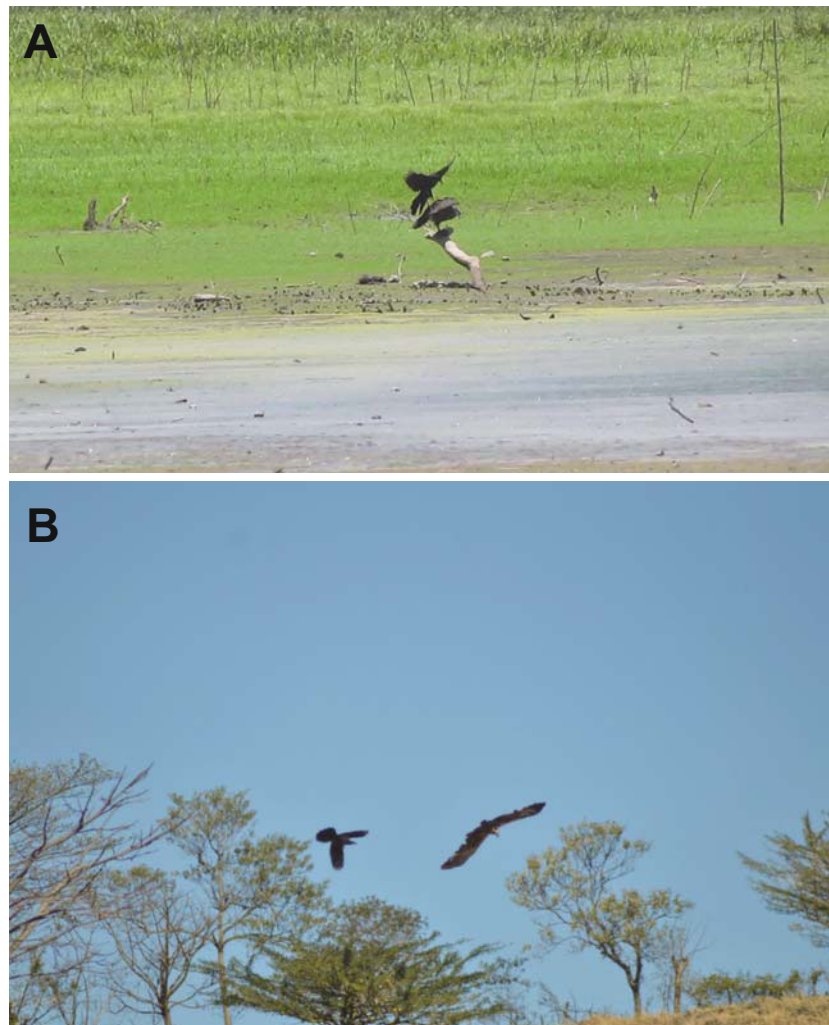
Figure 1. Attacks and intent of kleptoparasitism of a male Quiscalus mexicanus towards a juvenile Rosthrhamus sociabilis (A). Displacement of a female R. sociabilis by a male Q. mexicanus (B).

We observed agonistic interactions from Quiscalus mexicanus , which in Site 1 performed flock chases on an adult R. sociabilis which had captured a snail. These persecutions were carried out as an attempt to steal the snail captured by the species. Due to these persecutions the Snail Kite moved to another place with its prey, without presenting aggressive behavior against its persecutors. Similar behavior of kleptoparasitism was observed on a juvenile, which was managing its prey on the perch and was frequently interrupted by a male Q. mexicanus (Fig. 1A), which made attempts to steal the snail and made a constant vocalization. In response to the attack, the juvenile chose to change the perch to end the consumption of its prey. On Site 2 we observed the displacement by an individual of Q. mexicanus against a female R. sociabilis (Fig. 1B). This behavior of kleptoparasitism against R. sociabilis has been observed by Sykes-Jr. (1987) in Q. major , a species that made constant attacks against Snail