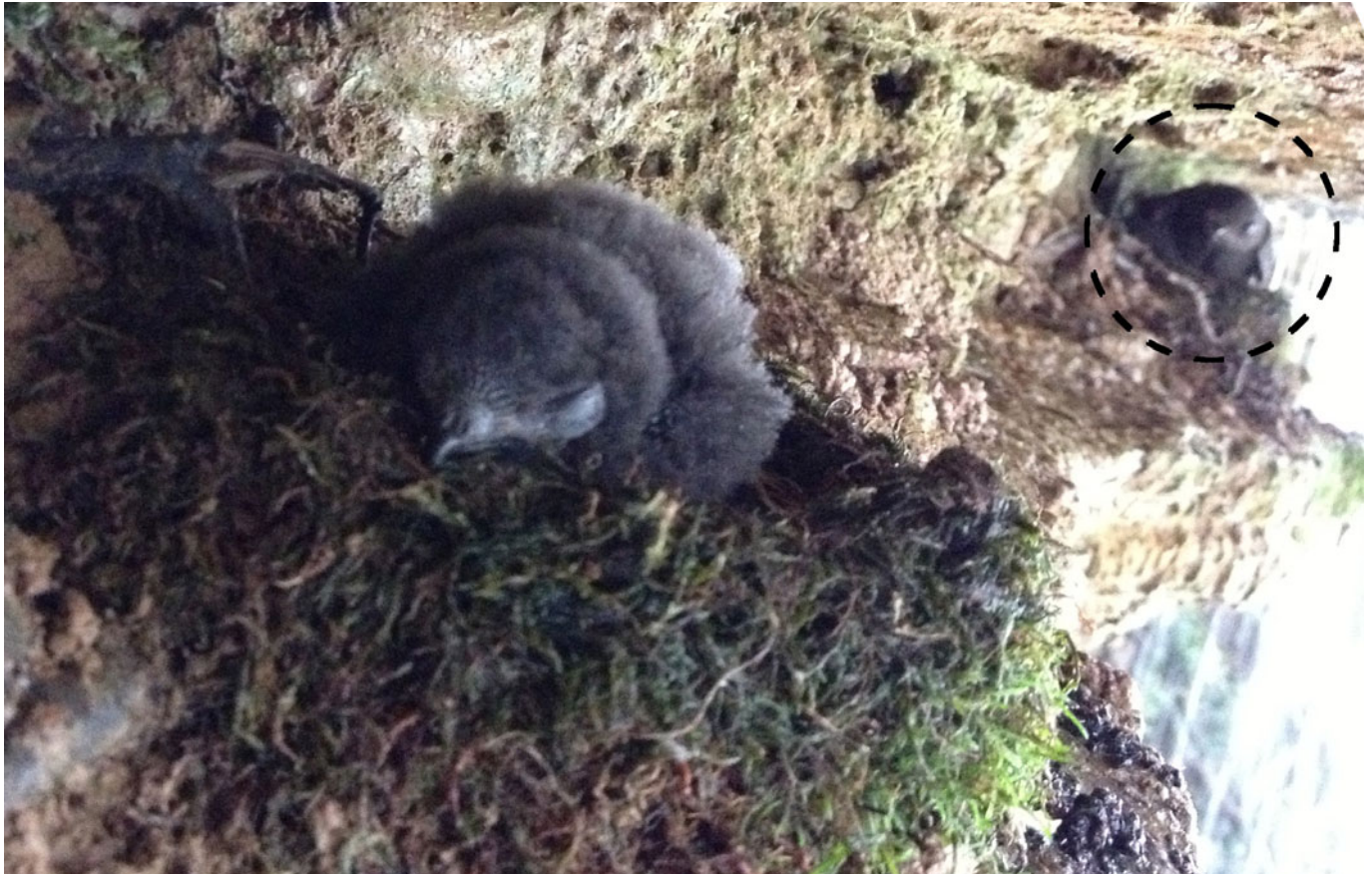
FIGURE 2. Locations of White-chinned Swift's studied nests (N1 – N4) on Asframa Falls, Rio Preto da Eva - Amazonas in 17 August 2013.

Such preference for preying upon winged individuals of Formicidae corroborates the report by Beebe (1949), who found “great quantities of Crematogaster and Azteca flying ants” in the stomach of one specimen and “winged female Azteca ants” in another specimen of C. cryptus . Howell (1957) observed c. 35 individuals of this species feeding in flight above the forest border at a clearing in Nicaragua, where the stomach content of one collected female was not identified, but believed to be Hymenoptera. Marín & Stiles (1992) reported contents of four stomachs and two boluses with 91.7% Hymenoptera (mainly Formicidae and Blastophagidae), but the Psyllidae records reported here are new.