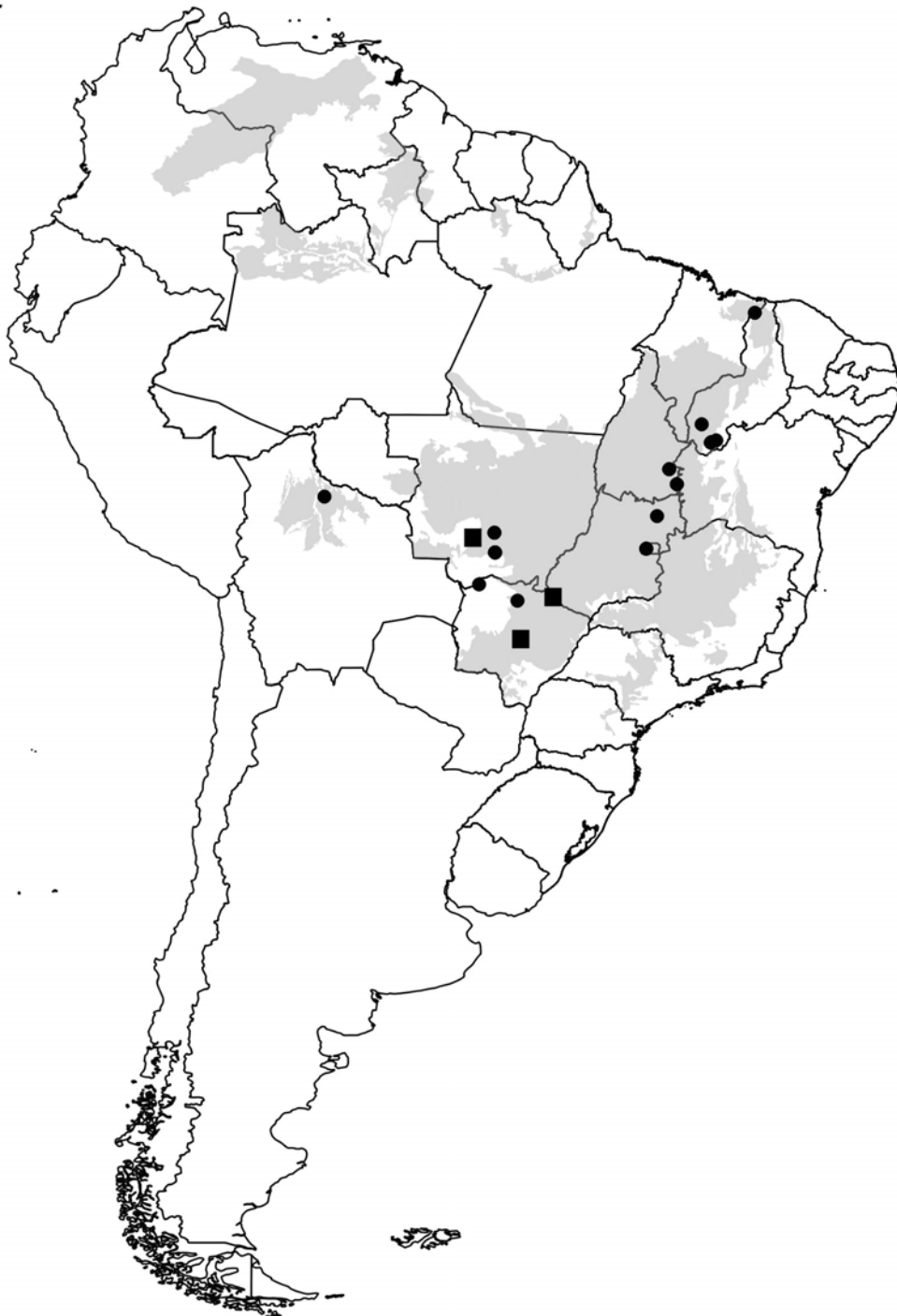
FIGURE 2. Black dots represent the occurrences of the studied colored bellied Alipiopsitta xanthops individuals, whereas the squares represent the locations of yellow neck individuals.

length (n = 21, median = 24%). The yellow mask also presents a great deal of variation, as adults have a yellow mask that completely covers the top of the head, while younger parrots generally display smaller masks without the orange ear-coverts (Figure 1). Some individuals have much broader yellow masks, contiguous towards the breast and belly (Figure 1, parrot 3). We observed 3 individuals with this particular coloration phenotype (hereafter yellow necked parrots, YNP), and they were restricted to the southwestern distribution of the species (Figure 2).