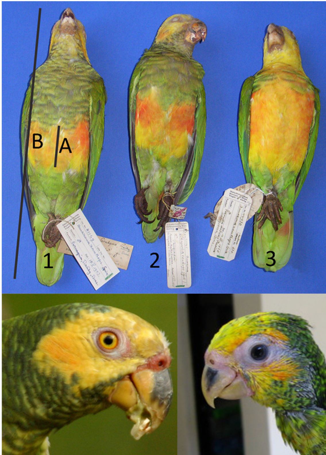
FIGURE 1. Top: some of the variation found in colored bellied parrots. A and B represent the measurements needed to calculate the plumage index (I) given by I = A/B . Parrot 3 is an example of a yellow neck parrot.. Bottom left: an adult Alipiopsitta xanthops showing the orange ear-cover. Bottom right: an A. xanthops nestling with a small yellow mask, and no orange ear-cover.

populations. Even though some individuals could be recounted, we expect that our final estimation represents a value very close to what may be found in these areas. Additionally, we made the observations on distinct days and (as much as possible) in distinct areas, further reducing the possibility of overlapping parrot counts.