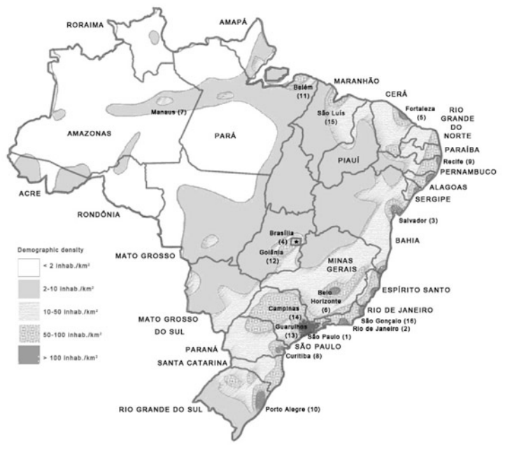
Fig. 1. Map with political divisions and demographic density of Brazil. The country has 27 states and a Federal District (Brasília).<sup>1</sup> Brazilian cities with more than one million inhabitants are shown. The majority of the Brazilian population resides in coastal areas and in the Southeast and South Regions.

Brazil is still considered "flawed".<sup>11</sup> This is especially due to the lack of political culture and participation amongst a considerable percentage of the population, which still has limited access to health and education services, and are alienated from political decisions.<sup>12,13</sup>