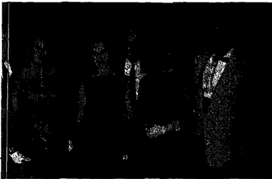
Seen at Dance

Monday, June 23, and Wednesday, June 25, while the Annual General Meeting required two sessions for completion of business