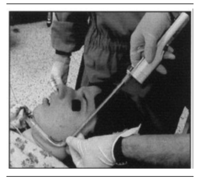
FIGURE 1 The short arm of the "J" is equal to the gonal anglesymphysis distance.