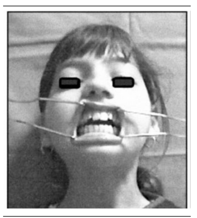
FIGURE 2 Temporo-mandibular joint ankylosis: maximal mouth opening.

Nasal bleeding was noted in 5.3% of the patients, while complaints of sore throat and/or hoarseness were recorded in 44% of patients.