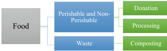
Fig. 12.1 Food management by food type

A question may be raised about the role of non-profitable organizations and private sector in food waste management while the Domestic Solid Waste Management Centre (DSWMC) in Mesaieed is the largest composting facility in Qatar with a capacity of 550 tons of waste per day. The process in which the food waste is collected by this center does not involve the segregation of food. Therefore, charitable efforts by non-profitable organizations and private sector can assist MM, but not as a replacement.