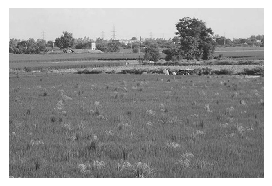
Fig. 1 Effect of repeated use of farm-saved seed on crop quality. Roadside view at Phurlak village, Haryana (India)

genetic identity and purity in crop varieties, and the general agronomic and seed technology principles that are to be followed for production of quality seed.