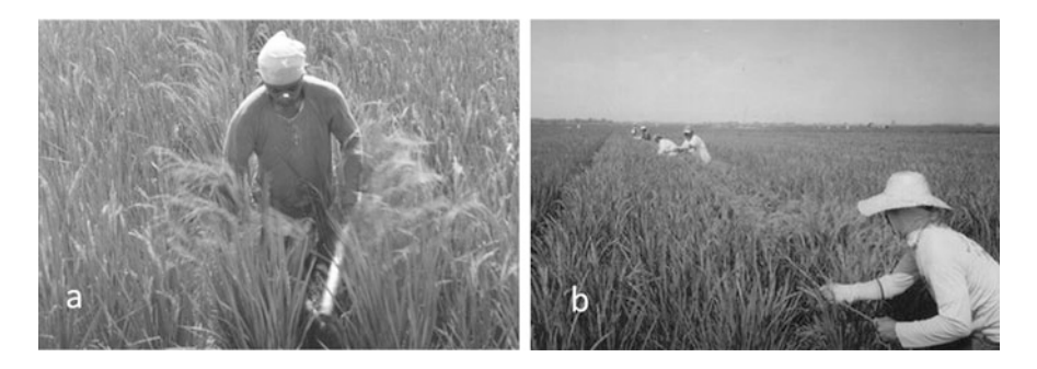
Fig. 7 Supplementary pollination in hybrid seed production of paddy: (a) by beating the male parental lines with wooden stick and (b) by polling the rope over male parental lines.

when it is harvested. The germination and vigour of the seed are at peak when the seed attains physiological maturity (Ghassemi-Golezani et al. 2011). However, as the seed moisture is quite high at this stage, seed is harvested only once it attains a safe moisture level that allows safe processing and storage (Ellis 2019). In plants with determinate flowering habit, seed maturity is uniform, whereas in crops with indeterminate flowering habit (carrot, sugarbeet, etc.), harvesting needs to be timed to obtain maximum seed yield and quality. Method of harvesting also influences seed quality, hence selecting the right method of crop-appropriate harvesting is important. Harvesting and threshing equipment must be thoroughly cleaned before harvesting each variety to avoid mechanical mixtures.