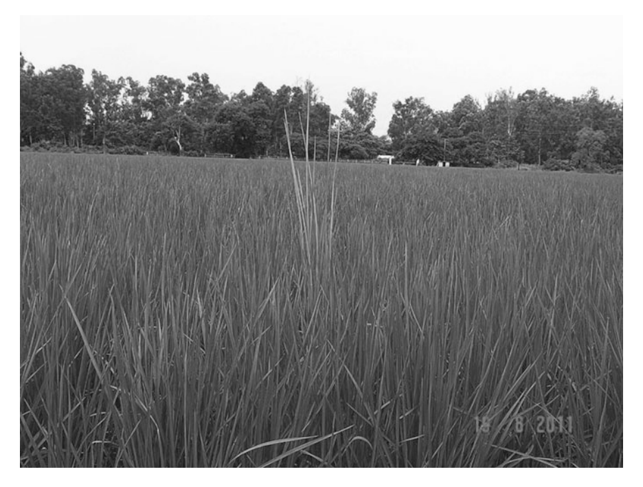
Fig. 3 Bakane disease caused by Giberella fujikuroi resulting in the abnormal elongation of culm in paddy

In case of foliar diseases, the size of the seed gets affected due to the poor supply of photosynthates from the infected plant parts. In case of seed and soil-borne diseases, use of infected seeds can cause widespread disease occurrence in the commercial crop (Fig. 3). Control of diseases through the use of healthy seed, and in some cases pesticide-treated seeds provide an effective means minimizing the pesticide use.