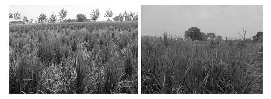
Fig. 2 Level of varietal mixtures in paddy as a result of mechanical mixture during seed production and post-harvest operations

It is a physical process by which the seeds of other varieties may get mixed inadvertently and deteriorate the genetic purity of the given variety (Fig. 2). This may happen through the seed drill during sowing, through wind carrying the harvested crop from one field to another, in the threshing yard where many varieties are kept together, during processing operations, etc., and also through rodents or other interferences. Hence, care is needed during production (roguing), harvesting, threshing and further handling to avoid mechanical admixtures. Proper hygiene needs to be maintained at stores and seed processing equipment needs to be thoroughly cleaned after operating each seed lot. In case of hybrid seed production, the male parent rows are to be harvested first and removed from the field before harvesting the seed crop (female parent rows).