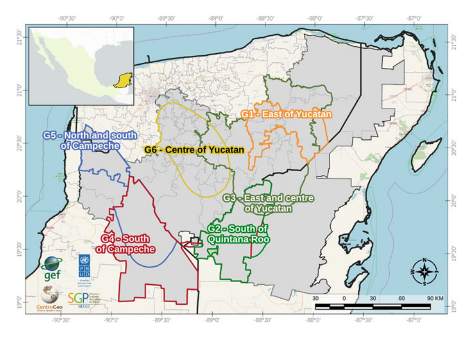
Fig. 5.2 Sub-landscapes of the FML as defined by six groups of participants from different regions (prepared by Rosa Martha Peralta)