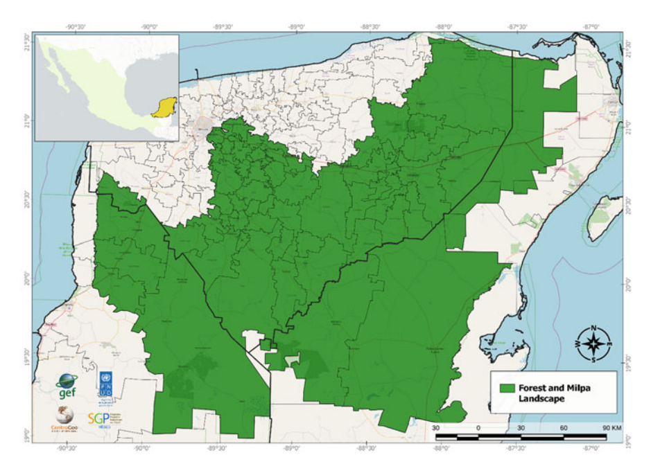
Fig. 5.1 Regionalisation of the forest and milpa landscape