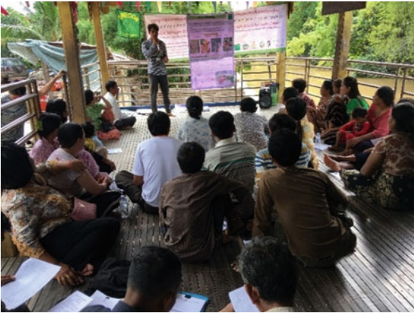
Fig. 11.3 Workshop on composting