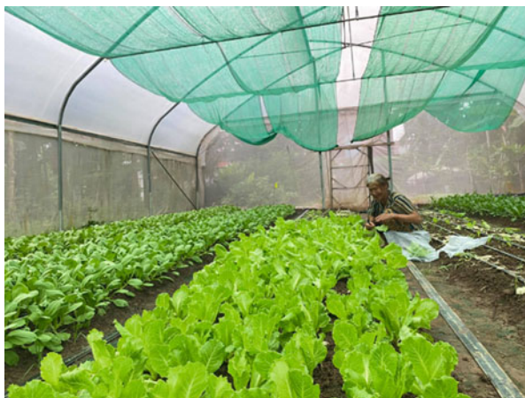
Fig. 11.5 Organic vegetable farm of a DG member

During project implementation, we observed the active involvement of women. Several of them supported the extension officers during trainings and workshops by