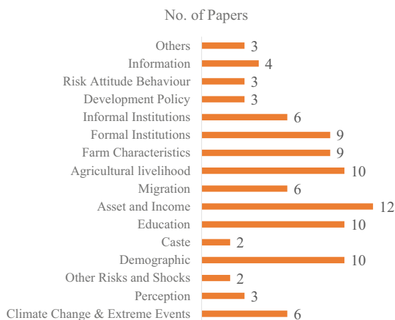
Fig. 4.3 Frequency of determinants appeared in the quantitative papers.

two steps, i.e. first is the farmer's perception about climate change, and then adoption of several adaptation measures (Bahinipati & Venkatachalam, 2015). Six papers consider extreme events as explanatory variables, and these are Panda (2013), Panda et al. (2013), Bahinipati (2015), Bahinipati and Venkatachalam (2015) and Kakumanu et al. (2016), Patnaik et al. (2019). Bahinipati and Venkatachalam (2015) and Bahinipati (2015) consider three variables to account for the impact of cyclones and floods, e.g. high, moderate and low. Kakumanu et al. (2016) report that variables related to climatic shocks such as drought, untimely rain and irregular weather influence the adoption of farm mechanisation and supplementary irrigation. Likewise, Panda et al. (2013) and Panda (2013) find that loss incurred due to drought has significant positive association with adaptation options, but not statistically significant. Whereas, Patnaik et al. (2019) observe that drought-affected farmers are more likely to undertake agricultural adaptation options.