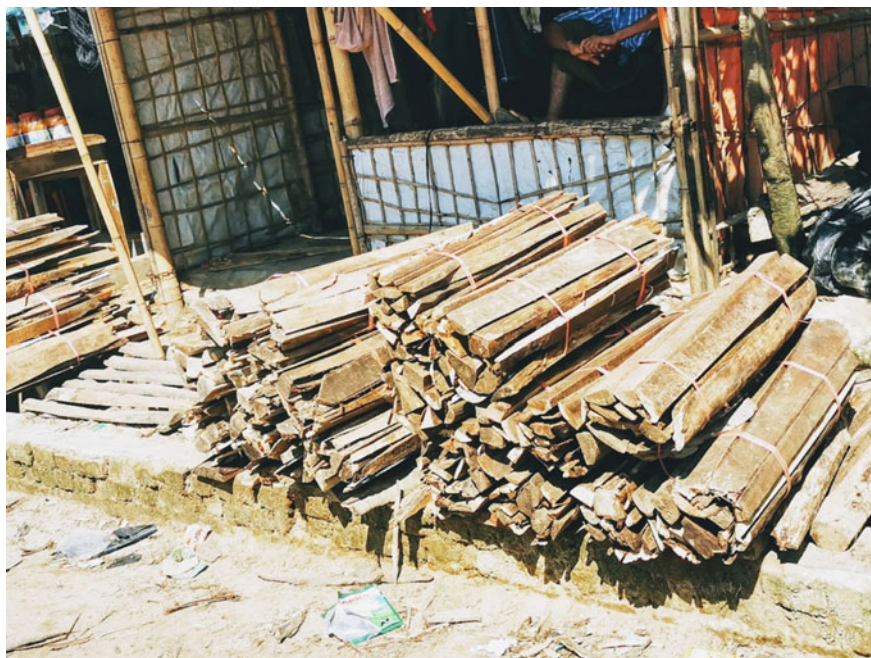
Fig. 12.1 Fuelwood shop inside the Rohingya refugee camp.

Estimates from our study suggest that immediately after the arrival of Rohingya refugees the demand for fuelwood was nearly 4.76 kg per household per day and the annual biomass extraction rose from a regular 95,000–462,000 tons in a year (International Union for Conservation of Nature and Natural Resources, 2019), well beyond the sustainable yield of the forest. With depletion of forest land, human–wildlife conflicts began in the area. Attacks by elephants and snakes were on the rise and IUCN, Bangladesh, was invited by the UNHCR to step in to devise strategies to reduce such incidents.