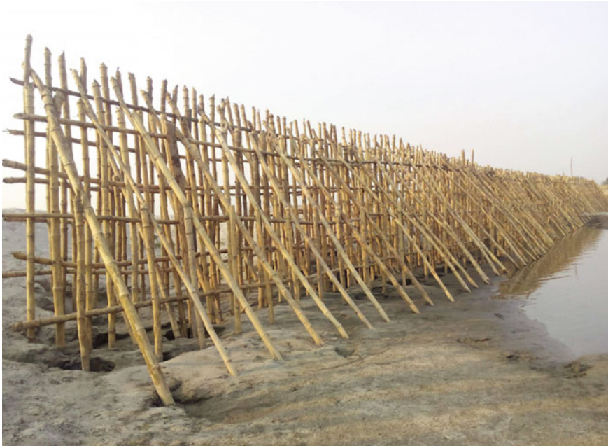
Fig. 12.4 Construction of bandalling.

Villagers in Rowmari upazila have recently used ‘bandalling’ to protect the bank of Jinjiram—a distributary of the Brahmaputra River, from erosion. Namapara is a village on the bank of the river with nearly 200 families who depend on agriculture for their livelihood. The river has been a constant threat because of bank erosion in rainy seasons, and to protect against this, they have got together and built several ‘bandals’ at different places. During 2017, the villages of Namapara raised a community fund to develop nearly twenty-four single-layer bandal structures (Fig. 12.4). The width of each bandal structure was between 10 to 30 feet. The combined length of these structures was about 400 feet long and primarily helped to protect villagers from riverbank erosion (Shishir, 2020; Siddique, 2020).