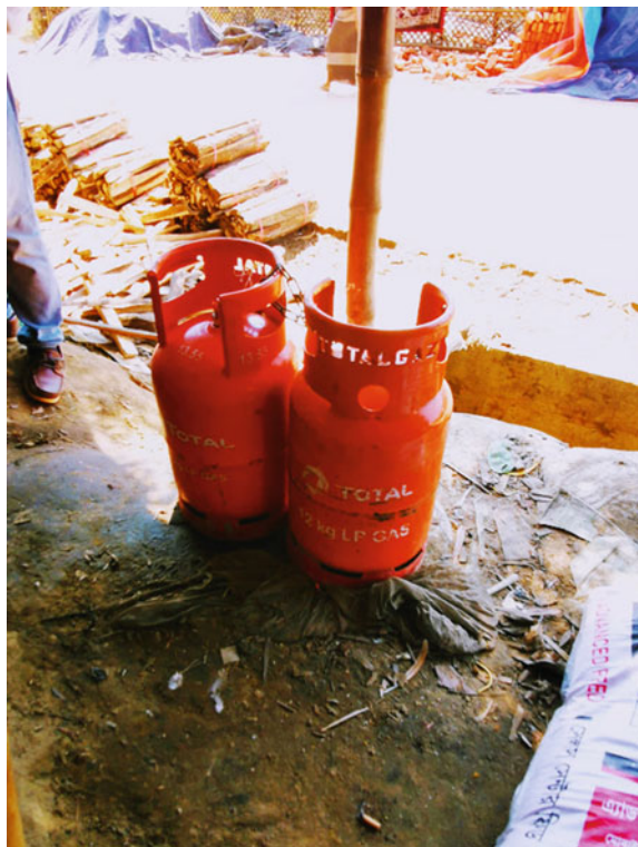
Fig. 12.3 LPG distribution centres inside the camps.

Third, wide-scale adoption of LPG for cooking in and outside the camp area resulted in a significant reduction in CO 2 equivalent emissions. Estimates show that there was a net reduction of 0.82 million tons of CO 2 (equivalent) due to the introduction of the LPG use among the refugees and in local communities (Fig. 12.3).