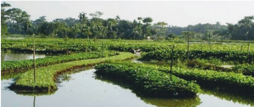
Fig. 12.5 Floating beds.

Studies have shown that floating agriculture practices if effectively managed could reduce adverse impacts of waterlogging and turn a temporarily inundated waterbody into a potential soil-less agricultural land. Besides Bangladesh, floating gardens of Xochimilco in Mexico and Dal Lake in India also have historical backgrounds. Originally, Baira was used for seedbeds for seedlings of rainwater varieties of rice in Bangladesh. However, with interventions from the government and from the NGOs,