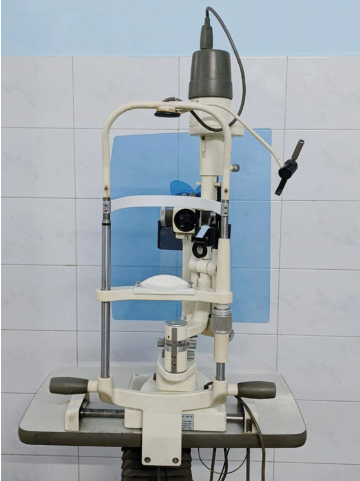
Fig. 8.3 Custom-made slit lamp breath shields