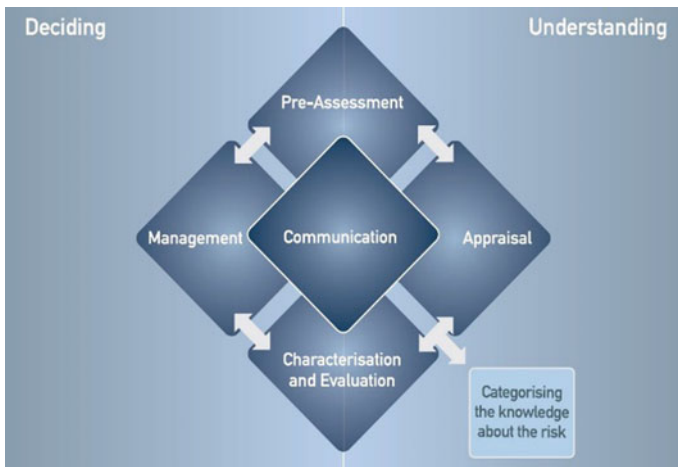
Fig. 8.2 Framework for integrated risk governance (IRGC 2016)

IRGC has developed a new theory of international risk governance framework, including five elements (Fig. 8.2).