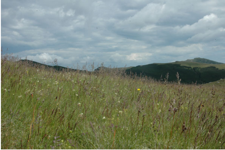
Fig. 17.3 Natural Park Bucegi, Festuca supina grassland (Natura 2000 code 6150)

temperatures (hegistothermophytes and psychrothermophytes). They are oligotrophic plants. The accompanying species are 89 % hemicryptophyte and chamaephyte. Seventy percentage of the identified species are dependent either on humidity (mesophytes and mesohydrophyte) or on low temperatures (hegistothermophytes, psychrothermophytes and microthermophytes), and 40 % are oligotrophic. About 52 % of the plant species of Festuca supina grasslands, include the dominant species, twelve rare plants and three endemics Achillea oxyloba subsp. schurii (Sch.Bip.) Heimerl, Androsace villosa var. arachnoidea (Schott, Nyman & Kotschy) R. Knuth, Dianthus glacialis subsp. gelidus (Schott, Nyman & Kotschy) Tutin, require both low temperatures and moisture for an adequate growth.