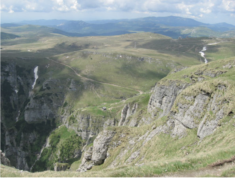
Fig. 17.1 Natural Park Bucegi, alpine grasslands on the plateau of the Bucegi mountains

26 % of its alpine grasslands (Puşcaru et al. 1956) and are the most widespread type of habitat in the alpine area (Administrația Parcului Natural Bucegi 2011) was used as an example.