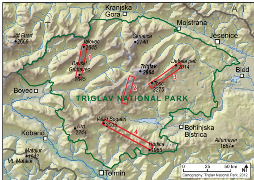
Fig. 12.2 Survey area of the mountain ranges: (1) Jalovec – Bavški Grintavec, (2) Kanjavec – Mala Tičarica, (3) Debela peč – Tošč, (4) Veliki Bogatin – Črna prst (Public Information of Slovenia 2008)