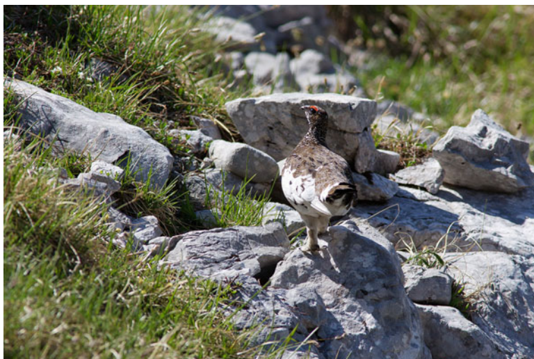
Fig. 12.1 Male of rock ptarmigan ( Lagopus muta ) in summer plumage

(Cramp and Simmons 1980). It occurs in flocks during autumn and winter, and is monogamous in breeding period. The rock ptarmigan is a species with short-distance movements during the year, in late summer it often moves only to higher altitudes (nival belt) (Cramp and Simmons 1980). In TNP, the species was observed within an elevation of 1,600–2,600 m a.s.l. during the summer period (Jančar 1997) and between 1,350 and 2,350 m a.s.l. during the winter period (Kmecl 1997). Optimal habitats for the species are grasslands, interspersed with smaller shrubs, high and small-scale variation of inclination and exposition. In winter both factors provide mosaics of variable snow cover and different snow heights, while during summer a variety of microclimates favour high plant and food diversity (Bossert 1980; Nopp-Mayr and Zohmann 2008). Size of territories in Alps varies between 10 and 35 ha, while the distribution, extent and numbers of territories appear to be rather stable for decades (Bossert 1980, 1995; Favaron et al. 2006). Breeding density varies among years and areas, and it is mostly estimated from 2 to 7 breeding pair per km 2 (Bossert 1995; Peer 2005; Nopp-Mayr and Zohmann 2008).