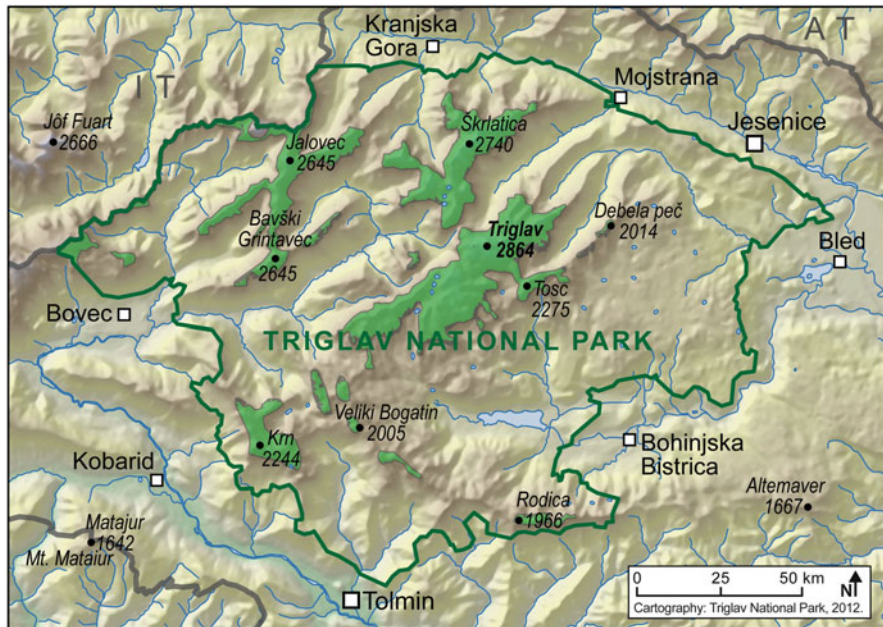
Fig. 12.3 Potential future nesting and wintering habitats in terms of habitat and altitudinal aspect for the rock ptarmigan ( Lagopus muta ) population in TNP (Cartography: Miha Marolt) (Jarvis et al. 2008)