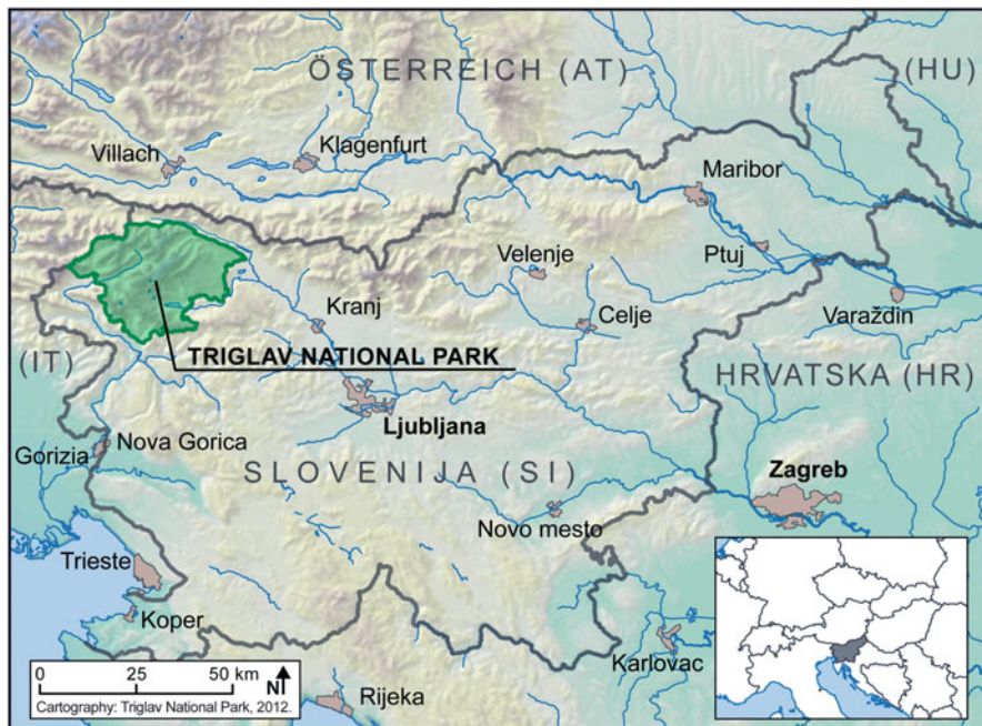
Fig. 11.1 The position of Triglav National Park in Slovenia (Cartography: Miha Marolt) (Modified from the Environmental Agency of the Republic from Slovenia 2010)

Long-term surveys of vegetation communities will provide a better understanding of the mechanisms of vegetation change as well as mechanisms of species coexistence (Bakker et al. 1996).