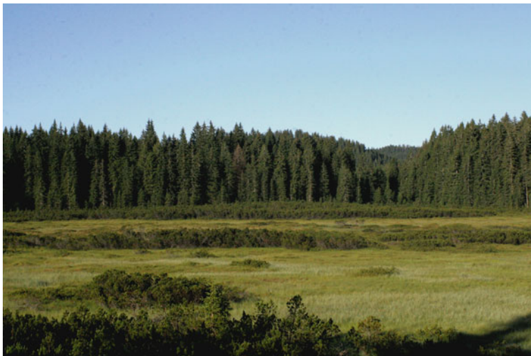
Fig. 11.2 Šijec peat bog in Pokljuka plateau

and bog woodlands with Pinus mugo and Picea abies . Anyway, this vegetation is only the transitional phase and among others also the result of natural processes in the past. The information about vegetation in the history and its gradual changing could be determined by pollens, which are stored in sediments, like peat layers (Šercelj 1996). Furthermore, on the base of stable isotopes of carbon, oxygen and hydrogen the changes in hydrology and temperature could be determined (Joosten and Couwenberg 2008). Considering the peatbogs as a place to accumulate the organic substrate (peat), of which at least 50 % is carbon, they are valuable to understand environmental changes in the past (Arnold and Libby 1949; Šercelj 1996; Joosten and Couwenberg 2008).