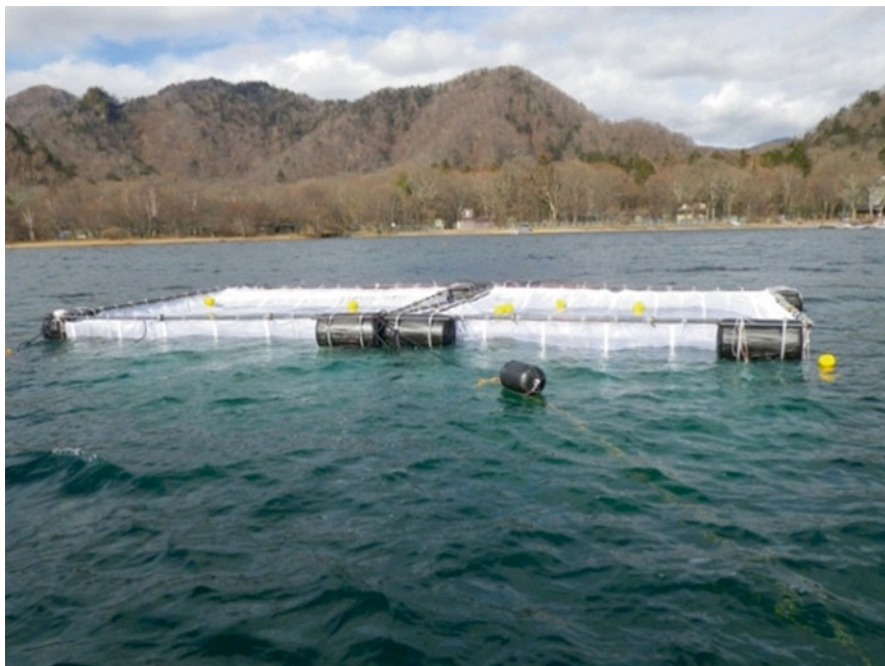
Fig. 19.1 Cages set in Lake Chuzenji

fork length and body weight of each fish recorded, and a sample of muscle tissue removed for measurement of radiocesium concentrations. During the experimental period, water temperature in the cages (1-m depth) had a range of 1.4 °C (27 February 2013) to 10.2 °C (29 March 2013).