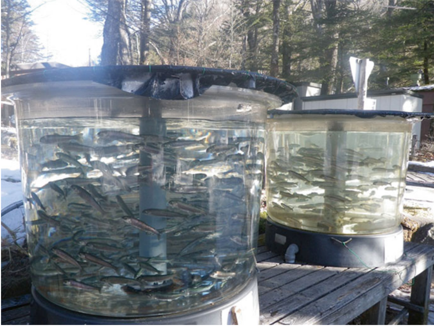
Fig. 19.3 An experimental facility in the Fisheries Research Agency for examining the process of radiocesium intake in salmonid fish

When fish were reared in water from Lake Chuzenji and a diet of commercial pellets, no radiocesium was detected in muscle tissue at any sampling period (detection limits, <1.74 Bq/kg) (Fig. 19.4). Final mean fork length and body weight ( \pm SD) of kokanee in this experiment were 162 \pm 12 (mm) and 49.5 \pm 11.4 (g), respectively. When fish were reared using spring-fed water and pellets containing radiocesium, radiocesium concentrations in muscle tissue increased rapidly during the experiment. At 93 days after the start of the experiment, the radiocesium concentration increased to 126.2 Bq/kg-wet ( ^{134}\text{Cs}/^{137}\text{Cs} , 0.51). Final mean fork length ( \pm SD) of kokanee in this experiment were 183 \pm 68 (mm) and 67.8 \pm 16.6 (g), respectively.