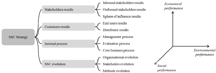
Fig. 3. SSC strategic definition

Decisions associated to this conceptual representation are done in an integrated way considering that they directly impact the performance in LCA, for example: