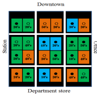
Fig. 4. Obtained layout by the proposed model