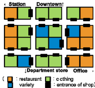
Fig. 3. Current layout of shopping street

The target area represents the underground shopping street where 24 stores and 8 exits are located. The number of passenger is assumed 15,000. Figure 3 illustrates the current layout of the shopping street and that is modeled in 1/4 scale of the actual shopping street in this paper. The number of passers is calculated by using the decreasing ratio of the area space [9]. The exits along four dimensions are set neighboring four different facilities located on the ground. The left-hand side is located along