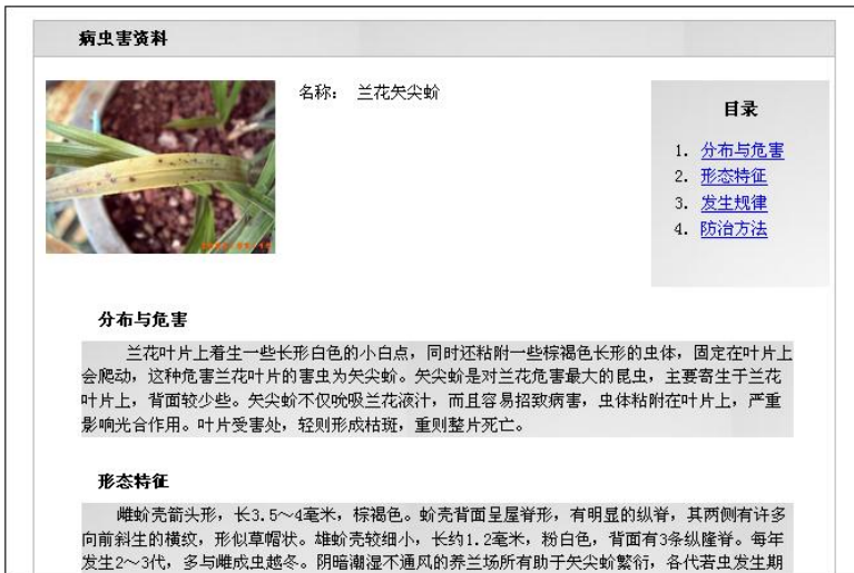
Fig. 3. Detail display interface of prescription search engine