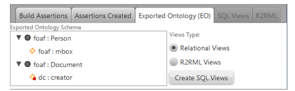
Fig. 4. Exported Ontology