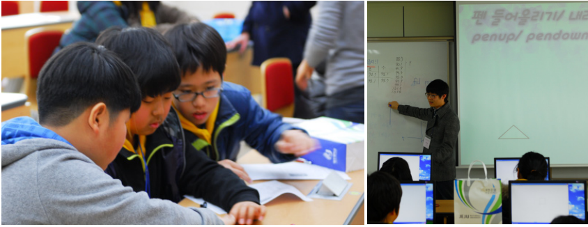
Fig. 2. Students's class working