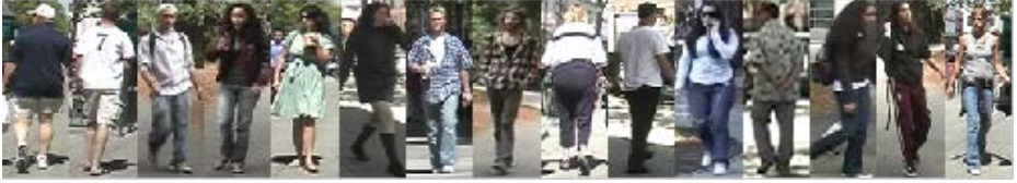
Fig. 1. Example positive images for each attribute in our ontology. From left to right: shorts, sandals, backpack, open-outerwear, sunglasses, skirt, carrying-object, v-neck, stripes, gender, headphones, short-hair, long-hair, logo, jeans.