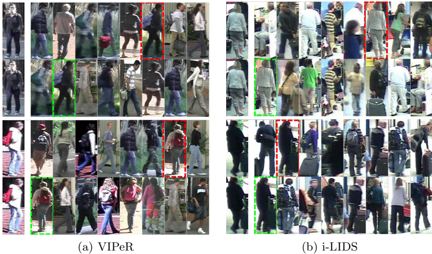
Fig. 4. Examples where MLA (green) increases the re-id rank of the correct match vs SDALF (red)

because of profile ambiguity (Fig. 2(a)) and limited accuracy of the attribute detectors (Table 1). Performing zero-shot identification enhanced with data from other camera (Section 2.4), we raise the CMC nAUC from 67% to 68% and double the Rank 1 match rate from 2% to 4% (Fig. 2(c)).