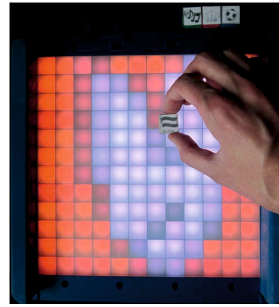
Fig. 5. The start of the “Ik hou van Holland” game. Placement of a wooden cube to select a category which triggers the shown “pincher grasp”