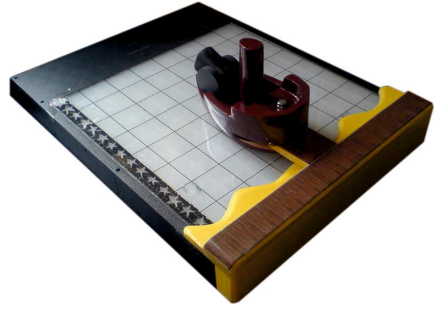
Fig. 3. The final version of the tangibles used for the boat shooting game

‘funny’ sounds is played and a point is awarded. If the wrist is raised while hitting, this is indicated by playing a spoken text. Once 16 points are achieved the game is won and the border of the board flashes green for several seconds.