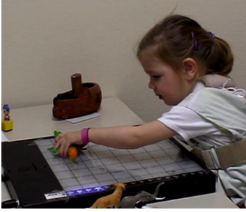
Fig. 2. A young girl playing the animal game