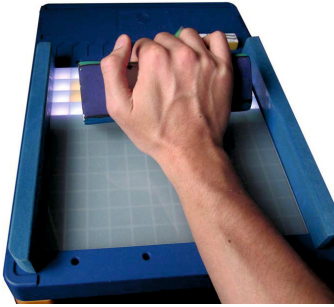
Fig. 4. Hearing the answers in the “Ik hou van Holland” game: tumbling a block, targets a passive form of rotating the hand backwards