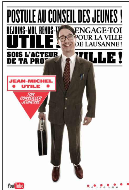
Fig. 1. The John-Michael Useful billboard ad, asking the youth to apply for the Youth Council

A Facebook profile was also created for John-Michael Useful, where he would post regularly and gather about 500 friends during the campaign. What is worth mentioning is that City of Lausanne blocks the use of Facebook by its employees, and that they had to ask for an exception to the Municipal Council (i.e. the executive branch of the local government). A dedicated machine with a separate Internet access had to be set up. This is not only an anecdote, but it shows how far certain public administrations can be from using social media for their official communication and for opening a dialogue with the people.