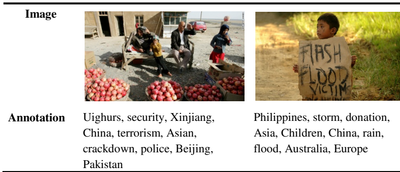
Table 4. Extracted annotation using proposed method

So, we are able to compare t_i and k_j and determine how much they are closed to. Eventually, we can obtain final annotation for given image through proposed process. The following Table 4 the news images and its annotation grasped automatically. The annotations are different from other traditional research that described object in given images. Recognizing an object in images is not cover major meaning of images. The proposed approach in this paper focused on the annotations which describe core meaning of given image. Hence, annotated words are semantically related to titles and images. We believe that this annotation can represent not only documents but also images. However, traditional approaches only can detect object in image so, results will be ‘human,’ ‘apple,’ ‘boy,’ ‘girl,’ and so on for first image in Table 4.