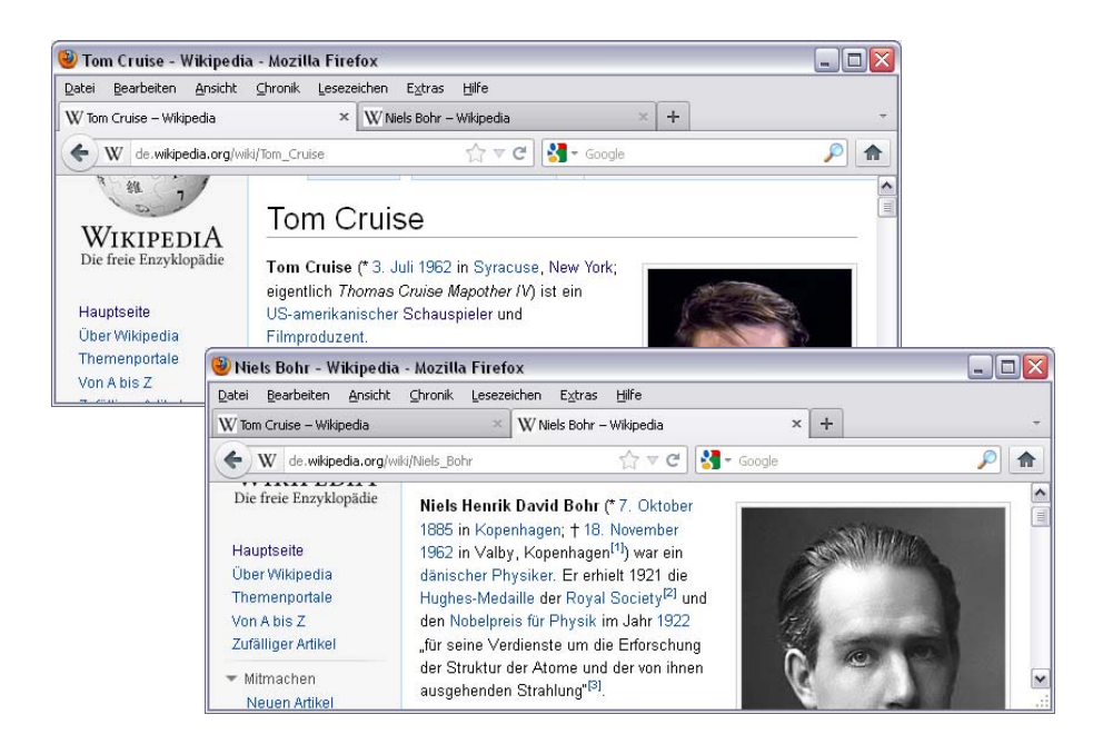
Fig. 3. Screenshots of abstracts of the Wikipedia articles on Tom Cruise and Niels Bohr. Tom Cruise was born in the year Niels Bohr died.

Furthermore we evaluated the usability of the user interface. This statistic is summarized in Table 4. The overall usability assessment was good. The best mean assessment was for user support by solving the searching tasks which was nearly very good. The participants again confirmed our hypothesis that