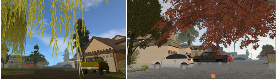
Fig. 2. Present Day Beach Grove Road, Delta (left) and Flooding risk in Delta (right)

to one of these three areas and affects the resources (money, water and food), adaptation measures and carbon footprint. The user interface includes bars that indicate how many resources are available, whether the carbon footprint targets are met and whether the community is protected with adaptation measures. Through these bars, the player is able to determine how many resources they can allocate to improvements as well as holistically check their progress in the game.