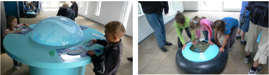
Fig. 2. (A) Visitors constructing fish based on a physical construction kit and (B) exploring the virtual ocean using the Hydrosopes (right)

Our second case derives from our work in the Interactive Experience Environments (IXP) project, aimed at exploring novel interactive installations for museums and science centres. Specifically, we focus on a prototype designed for the Kattegat Centre, which is a marine centre displaying marine life from all over the world. The centre is primarily composed of large aquaria with glass sides that allow visitors to explore the variety of marine life. As part of our research efforts, we designed a prototype installation for the centre, where visitors were invited to construct fish for a virtual ocean. Fish were constructed using a physical construction kit with embedded