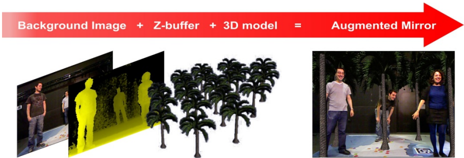
Fig. 2. Augmented reality scene composition using depth information

information, performing a correct occlusion between real (visitors and exhibition room) and virtual (3D models, maps, etc.) worlds. This process can be observed in Figure 2.