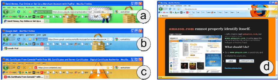
Fig. 1. Proposed Personas for a) Extended Validation certificate b) Standard SSL certificate c) Warning (unencrypted content); d) Browser with a standard Persona displaying the changed warning page for a non-matching URL.

Visualizing certificate details has been recently covered by Biddle et al. [2]. They evaluated a new kind of interface for those details based on guidelines making it easier to understand the certificate related information and in that way improved the accuracy of security decisions in that way. Alternatively, the users can be actively interrupted during their browsing task by showing them a dialog box and forcing them to decide on an option [4]. Unfortunately users tend to get quickly habituated and dismiss those messages without paying further attention [1]