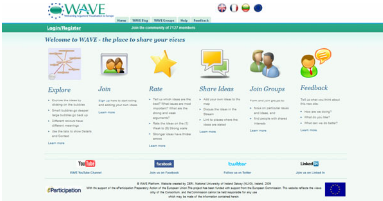
Fig. 1. WAVE Platform Home Page (EU pilot)

visualisation tool [9]. Debategraph is a wiki-based tool featuring both a graphical (flash-based) but also a text interface. Debategraph enables anonymously exploring maps by clicking on an idea which will result in presenting all ideas directly related to the clicked idea. Hence, by clicking the visitor can transverse from idea to idea throughout the whole map.