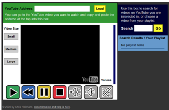
Fig. 5. Accessible Easy YouTube Player Interface [12]

BBC iPlayer allows providing subtitles. BBC includes in TV programming approximately twenty- five hours with audio description per week in different genres. However, similar to the other players, the user cannot control to play or not the audio description signal.