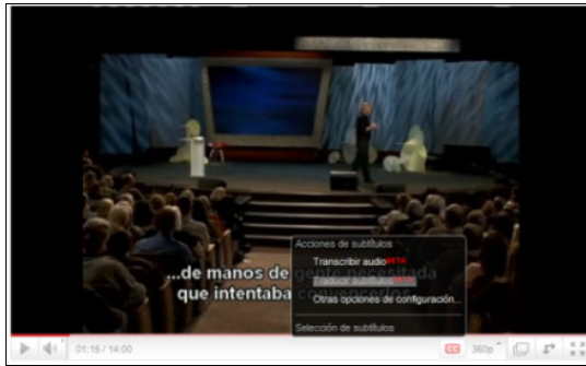
Fig. 2. YouTube's screenshot with subtitles and text setting menu