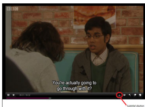
Fig. 1. BBC iPlayer's screenshot with alternative (caption) and mechanism to identify it