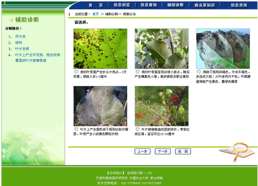
Fig. 2. The diagnosis page of TPPADS